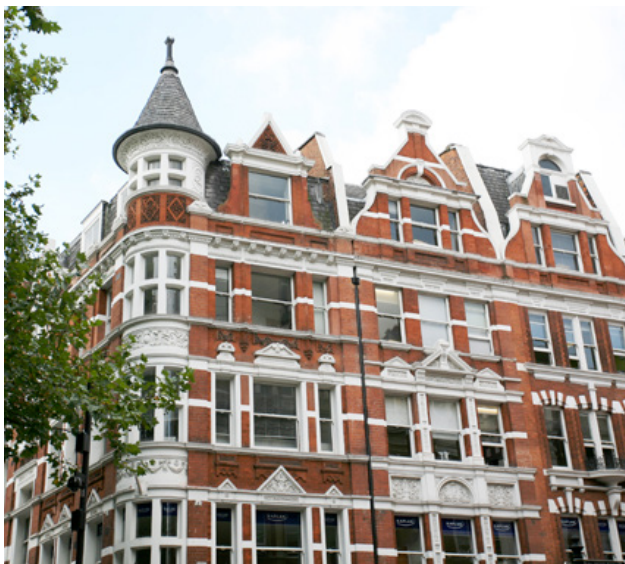
Kaplan International London, Leicester Square

London is one of the world's most remarkable and exciting cities. Marvel at its fantastic diversity of population and lifestyles reflected through the wide-ranging cuisines, fashionable shops, thriving music scene and wonderful West End theatres. Admire the spectacular view of the city from the London Eye, or explore the sights such as Big Ben, Buckingham Palace and the Tower of London. There is always something to do in London!