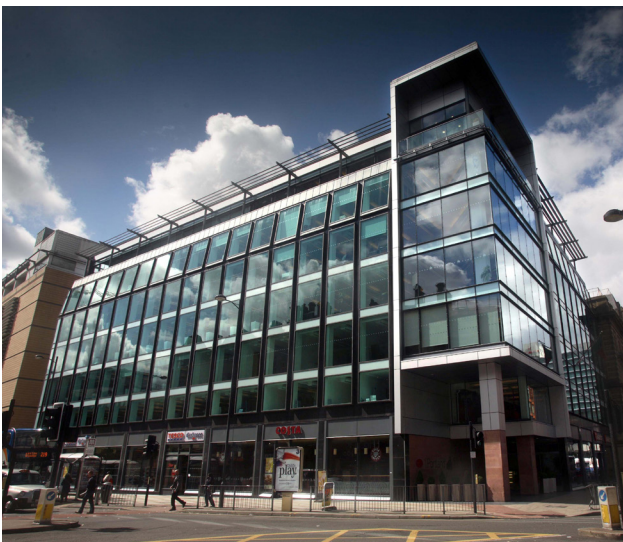
Kaplan International Manchester

The school is centrally located on Portland Street, within walking distance of a variety of restaurants, bars and theaters. Facilities include large, well-equipped classrooms, a multimedia center and a student common room with internet access.