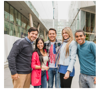
Kaplan students in Manchester