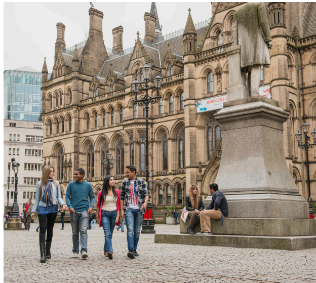
Manchester Town Hall

Journey time: 20 minutes. See www.nationalrail.com