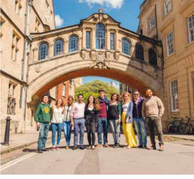
Sightseeing in Oxford

Train Journey time: 1 hour See www.nationalrail.com