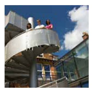
The school café