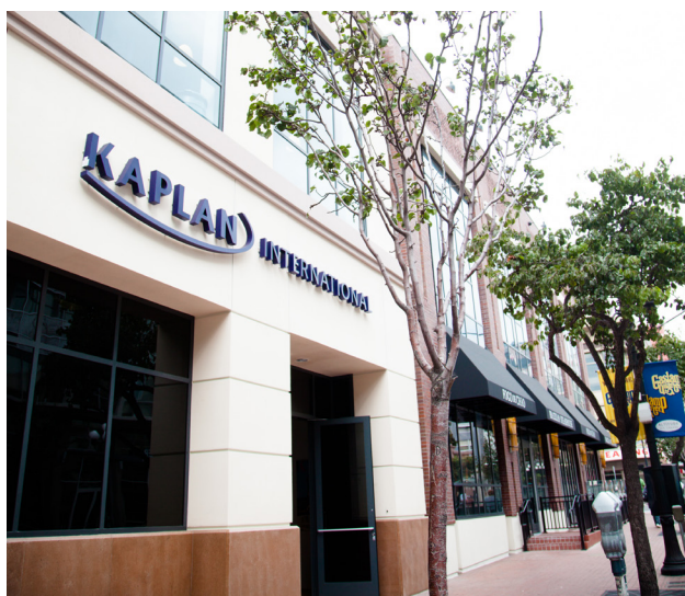
Kaplan International San Diego Exterior

The city is an outdoor recreational paradise (hiking, biking, surfing, skate boarding, jogging, sailing and other water sport). Students can visit famous attractions like SeaWorld, San Diego Zoo/ Safari Park, Balboa Park, historic Old Town/Presidio Park, Little Italy and the downtown Gaslamp district (restaurants, shopping, theaters and nightclubs). The city also offers a rich cultural and ethnic population, which is reflected in friendly people, a thriving art and cultural scene and wonderful restaurants, museums and shops. Finally, there is thriving nightlife in Pacific Beach, Hillcrest and Downtown. Los Angeles, Palm Springs, Santa Barbara, Baja California, Mexico and Las Vegas are all within driving distance of San Diego for fun weekend getaways.