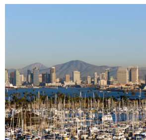
San Diego skyline