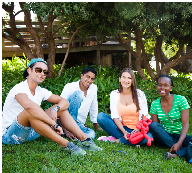
Activities with students

Taxi – approximately $35-$65 (+ 15% gratuity)