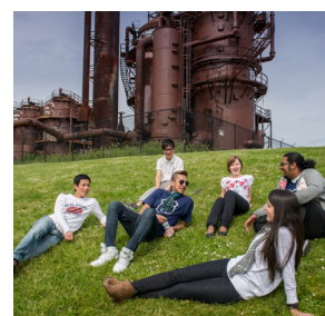
Relaxing at Gas Works Park