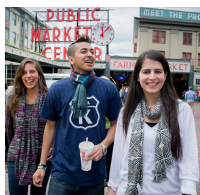
Strolling around Pike Place Market