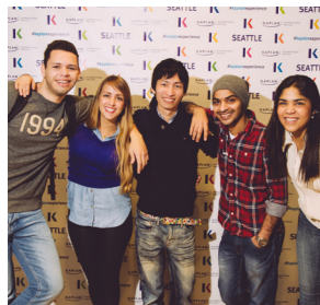
Kaplan students on campus

There are many shopping opportunities in the downtown area.