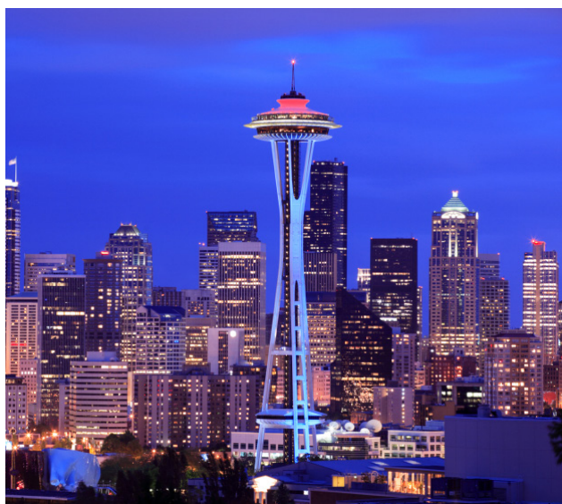
Seattle at night

Aside from great social activities for everyone, Seattle is a magnet for new start-up companies. It is home to some of the largest and most high-tech companies in the world, like Microsoft, Amazon, Boeing, Starbucks, and T-Mobile. All are open for tours.