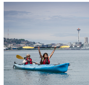
Kayaking Lake Union