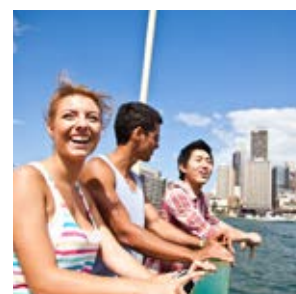
Catch a Ferry to and from Manly