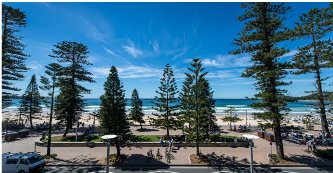
View from Kaplan International Manly