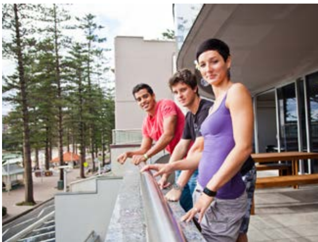
Kaplan International Sydney Manly