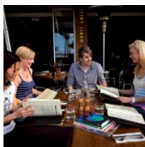
Cafés and restaurants