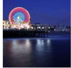
Santa Monica Pier