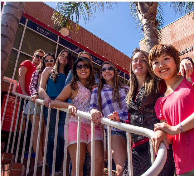
Kaplan International Los Angeles Westwood

We encourage you to take full advantage of our excellent educational quality programs and the overall experience of studying and living in the United States. Many of the Westwood students use our University Placement Services and transfer to Santa Monica College, which has a high transfer rate to schools like UCLA and the University of Southern California (USC).