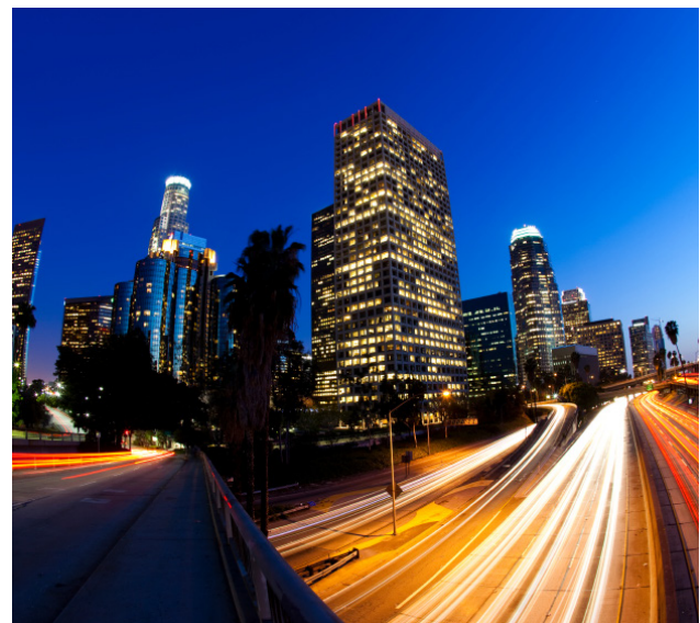
Los Angeles at night